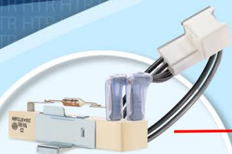
Ceramic encased resistor for HVAC - rear fan control (single speed)