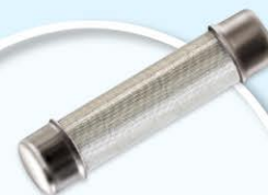
Reduction of RFI during electrical discharge of petrol engines