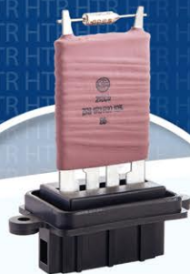
Ceramic type resistor for HVAC - 3 speed fan control